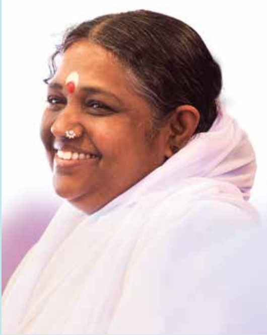
Sri Mata Amritanandamayi Devi

There are two types of Education Education for Living. Education for Life.